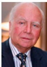
Mark Eyskens Minister of State